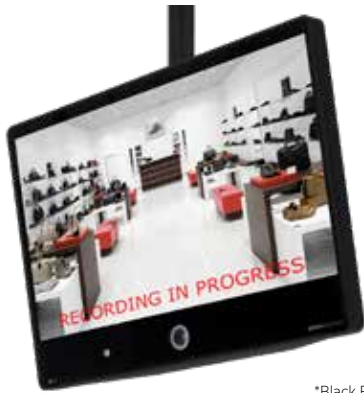
*Black Front / Black Cabinet

21" Public View Monitor w/ AXIS IP Camera