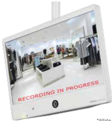
*White Front / White Cabinet

21" Public View Monitor w/ AXIS IP Camera